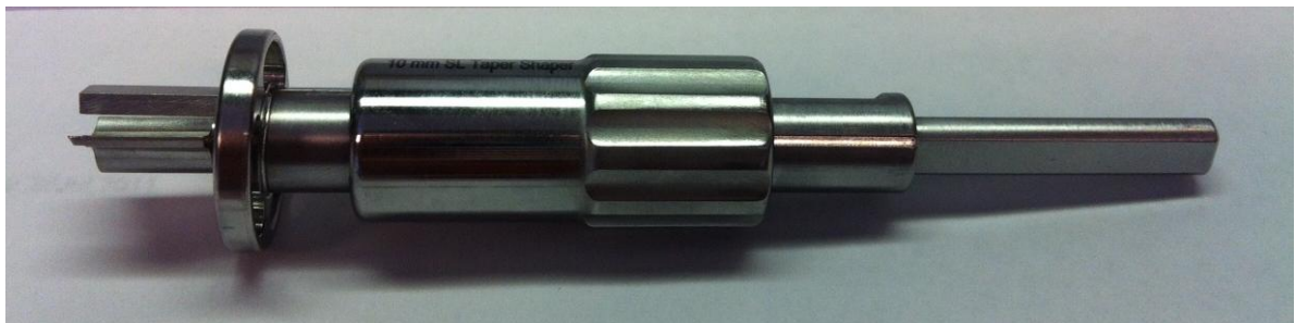
Taper Counterbore Shaper (shaping blade retracted)