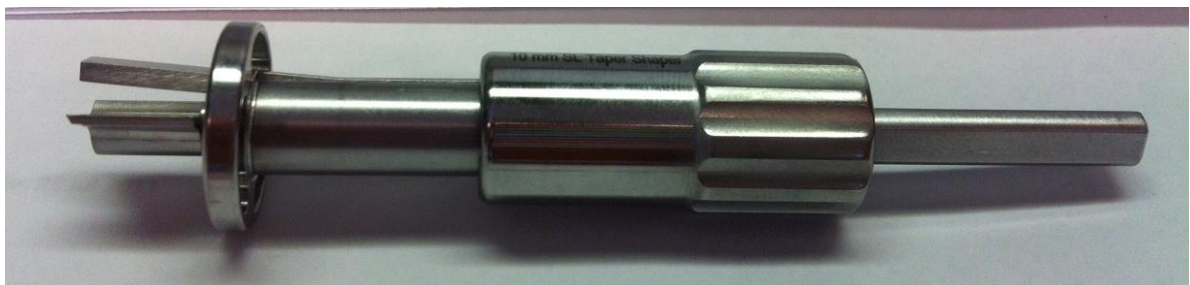
Taper Counterbore Shaper (shaping blade deployed)